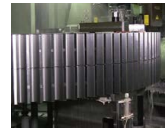
Stacking & Machining 2 Large Gears Together Finish-Machining (Polishing)