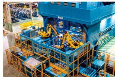
Destack Feeder for Aluminum

As a pioneer of transfer presses, AIDA offers 2-point and 4-point presses in a wide range of capacities, and we will recommend an optimized total production system tailored to your products.